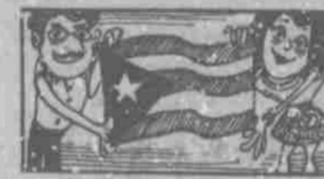
A model of the Puerto Rican flag was first developed in 1895.