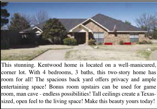
This stunning, Kentwood home is located on a well-manicured, corner lot. With 4 bedrooms, 3 baths, this two-story home has room for all! The spacious back yard offers privacy and ample entertaining space! Bonus room upstairs can be used for game room, man cave - endless possibilities! Tall ceilings create a Texas-sized, open feel to the living space! Make this beauty yours today!

Donors must be at least 16 years old, weight at least 110 pounds, and be in good health to donate. Donors between 16 and 22 must meet additional height and weight requirements. 16 year old donors must present a minor donor permit formed signed by a parent or guardian. The permit can be found online at www.unitdbloodservices.org.