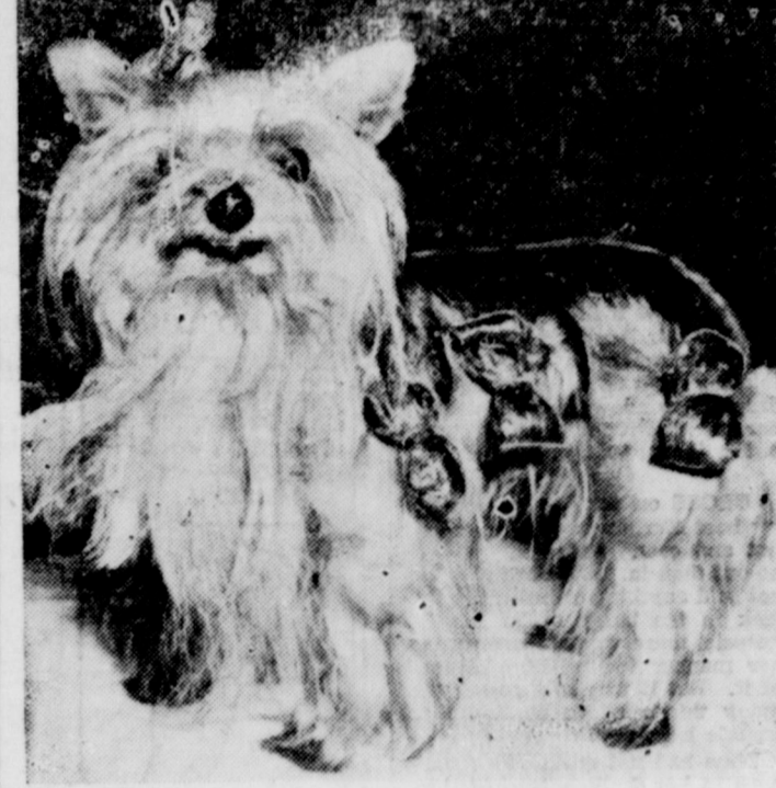
Yoo, hoo, Aigernon! Where are you having your hair done these days? Here's one pup that would have a sad time of it down in Hogan's alley, but he's more interested in blue ribbons. The curly canine is an entry in Madison Square Garden dog show, New York.