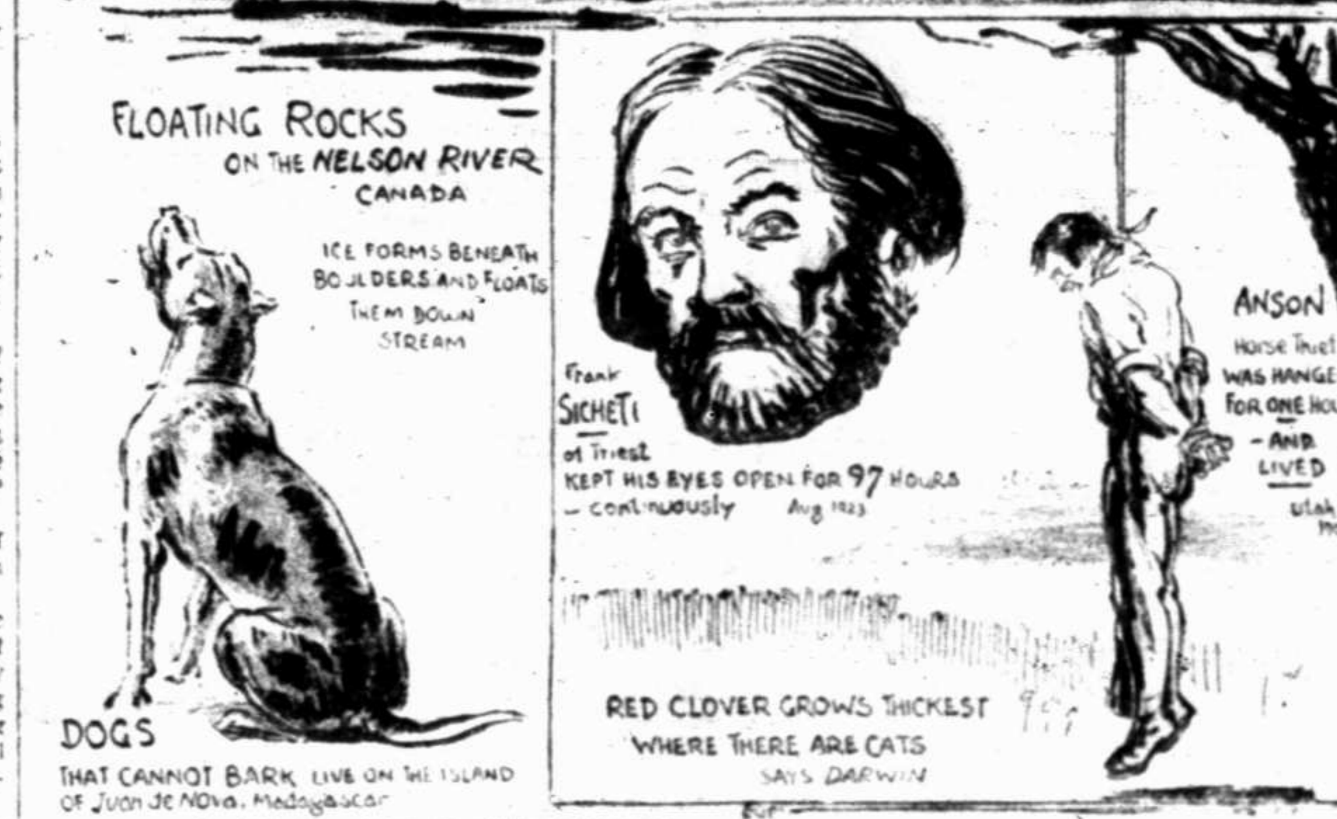
DOGS THAT CANNOT BARK LIVE ON THE ISLAND OF JUVA DE NIDA, MADAGASCAR