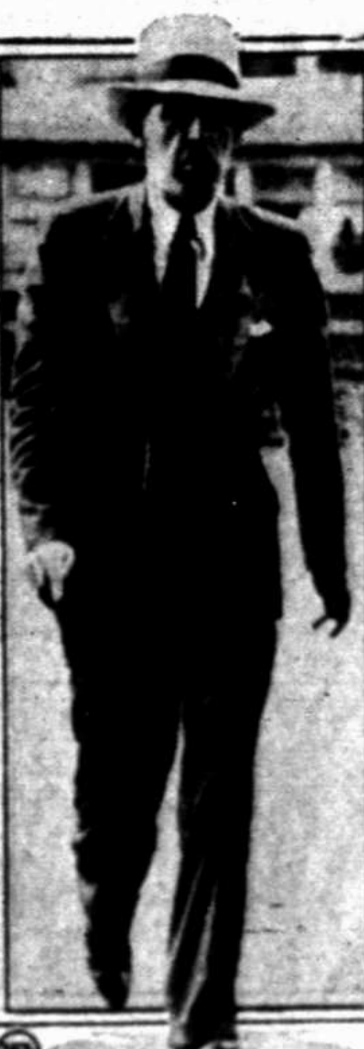
JACK (LEGS) DIAMOND