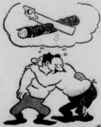
THE LONGEST WRESTLING MATCH ON RECORD LASTED 7 HOURS AND 43 MINUTES.