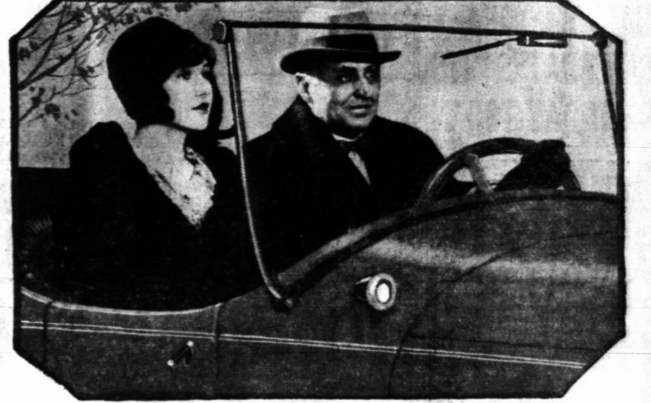
It was then that Jimmy saw it was Mary with him.

CHAPTER XXVI JIMMY, studying the letter, frowned. It was written in the same large, scrawly hand as the first one.