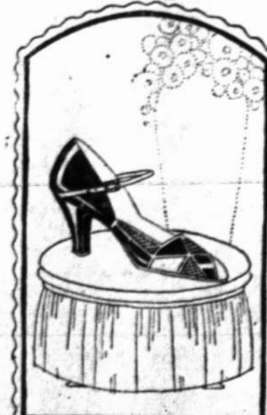
Now we have shoes with the new "modern" designs in vari-colored kid and suede combined with patent leather. The slender strap has a jeweled buckle.