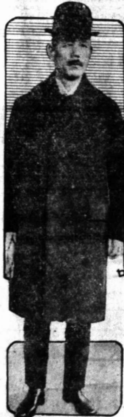
Adolphe Wakatsuki, former home minister of Japan, has been named premier of that nation, succeeding the late Viscount Kato