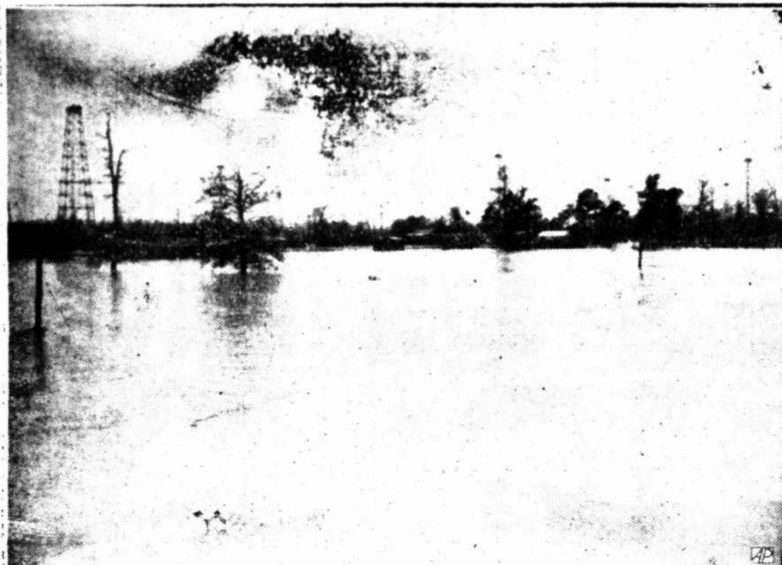
Swollen by torrents of rain, Rabbit Creek spread through the oil field area between Longview and Kilgore, Texas, as shown above. Many creeks and streams in East and South Central Texas were over their banks.