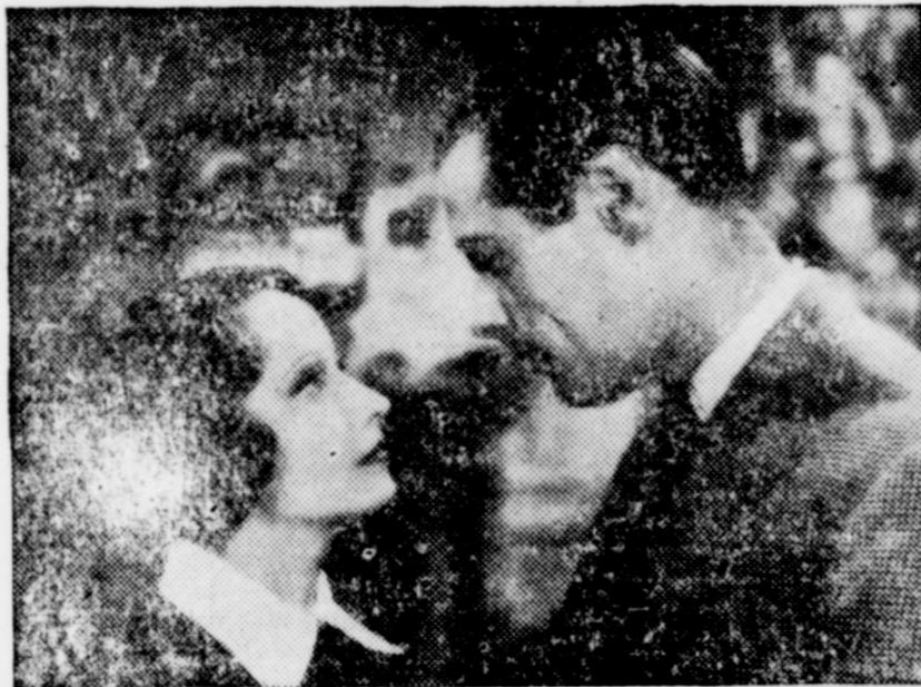
"You could do something for me, Freddie," she said.

"Perhaps — perhaps it would help you to make up your mind if you kissed me. I mean — then you might know better how I'd be..."