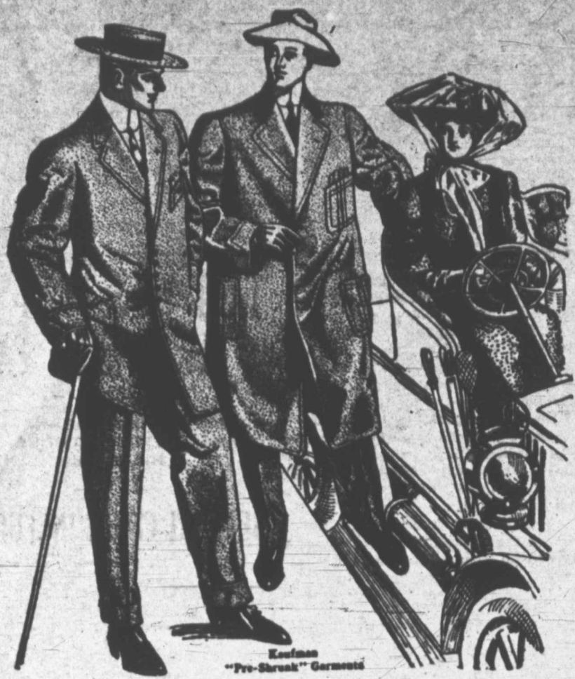
Clothes for Particular Young Men—

Designed and built especially for you are