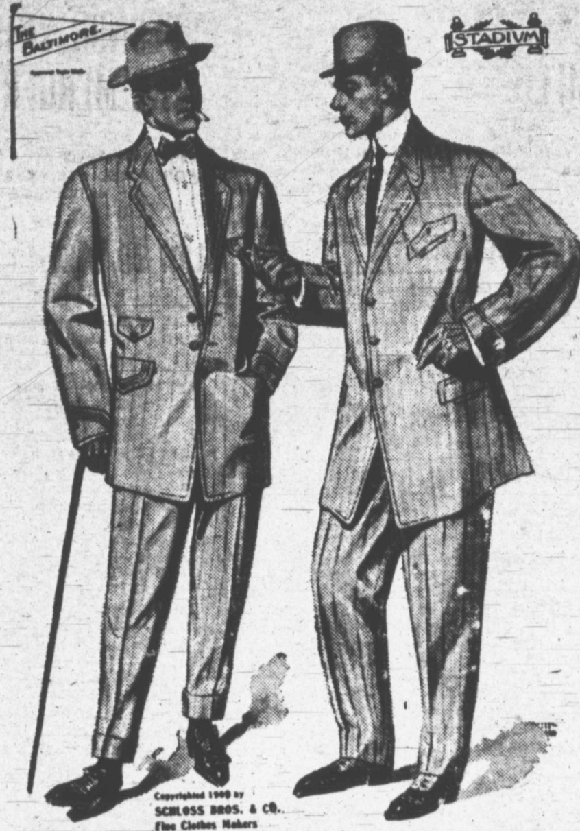
Copyright 1909 by SCHLOSS BROS. & CO. The Clothes Makers Baltimore and New York