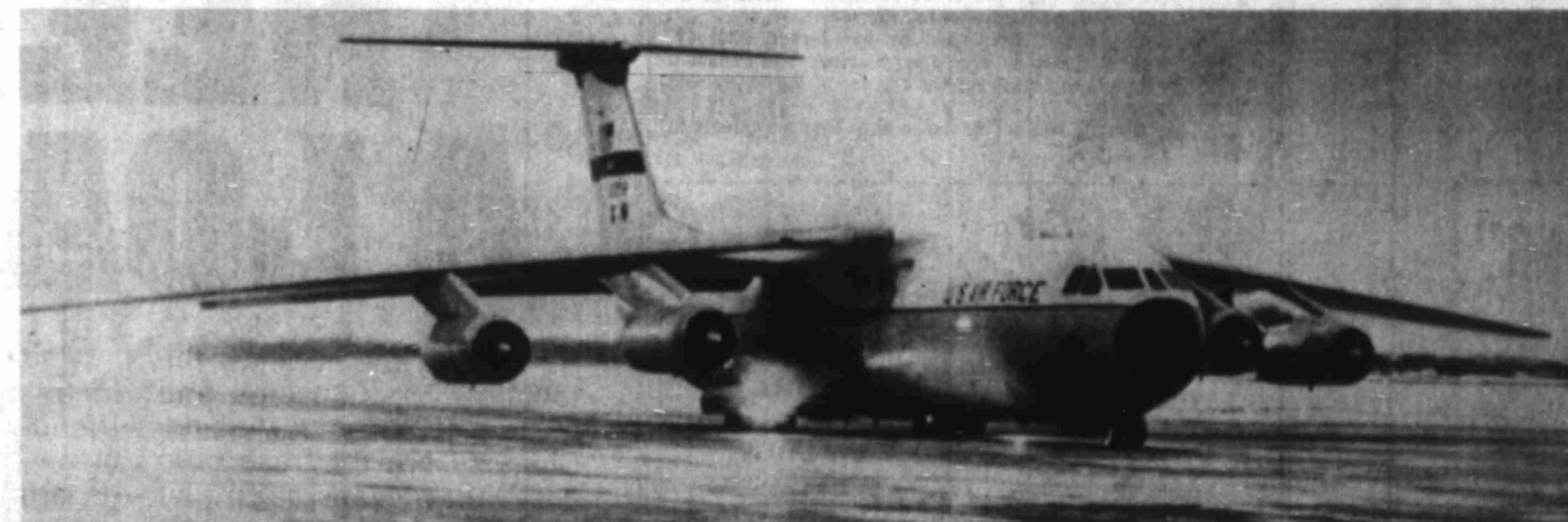
U.S. Air Force Starlifter jet transport taxis to a stop at Canadian Forces Base Edmonton Tuesday night with part of a contingent of

A team of U.S. experts in radiation detection and cleanup were flown from the Nevada Nuclear Test Site