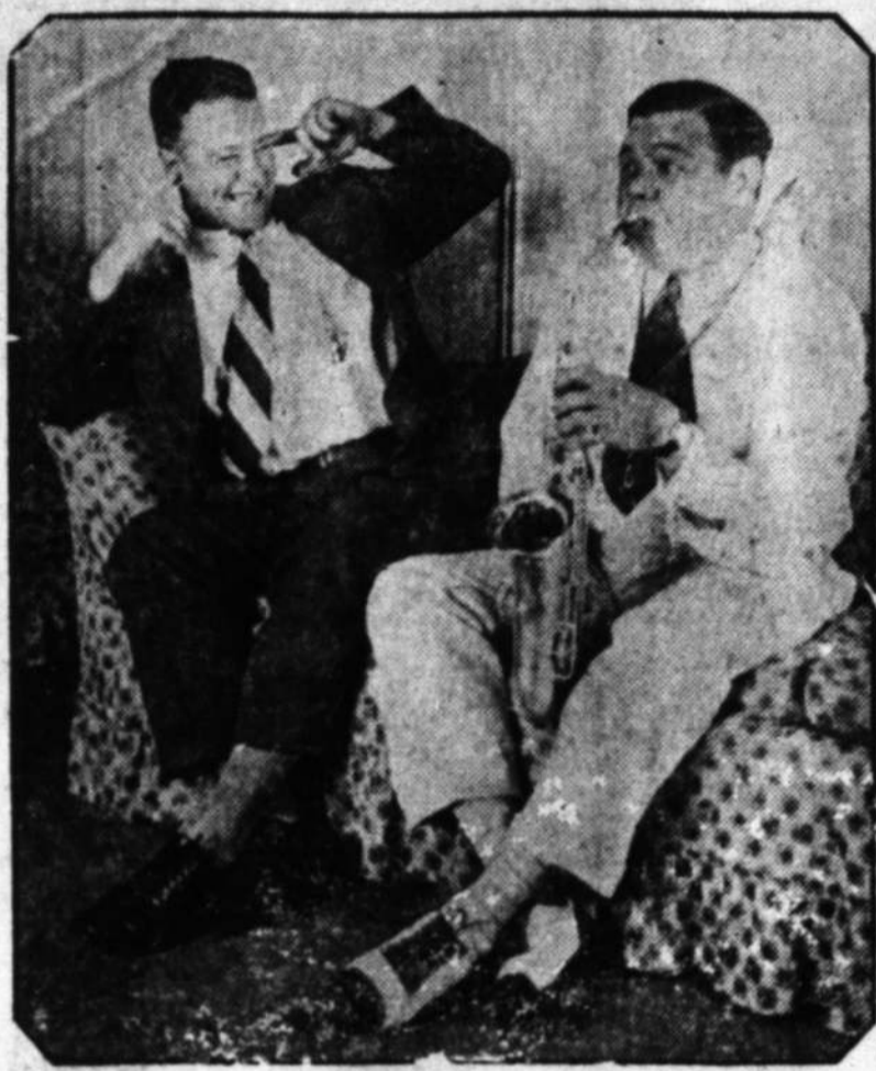
LOU GEHRIG AND BABE RUTH, WITH SAXOPHONE

Here's Babe Ruth tootin' away and Lou Gehrig laughing hilariously at the Babe's toots—just between spells of their struggle for the home run supremacy of the American League, and, incidentally, the world. The Babe was ahead when this photograph was taken and that's why he is playing so gleefully on the new sax given him by Paul Whitman, famous orchestra leader. And Columbia Lou is laughing at the Babe—perhaps because he intends breaking the Babe's record this season!