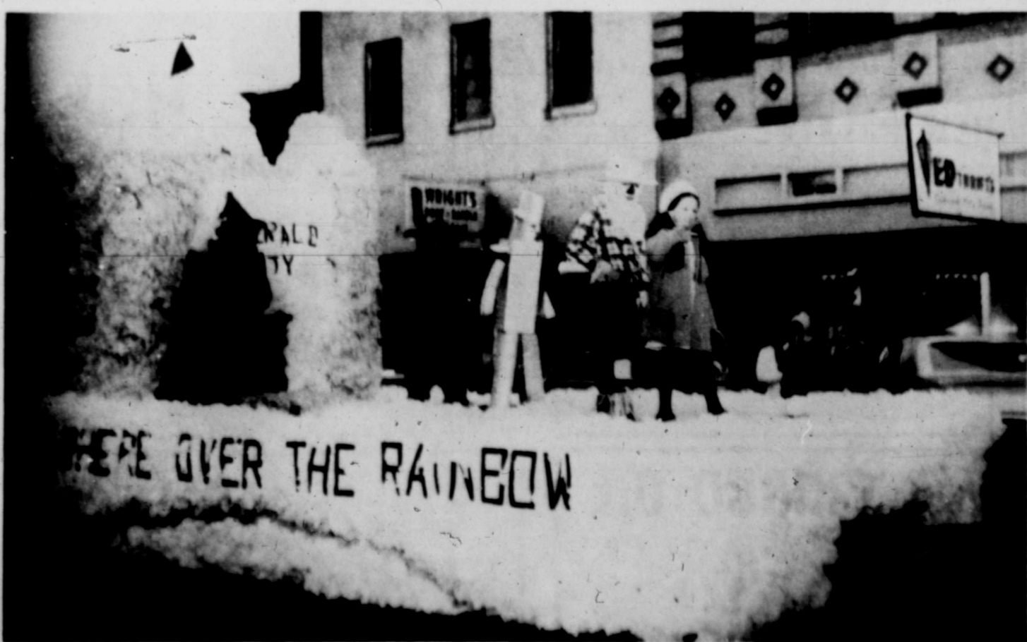
Scene From "Wizard Of Oz"