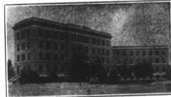
The Healing Hands of West Texas Baptists