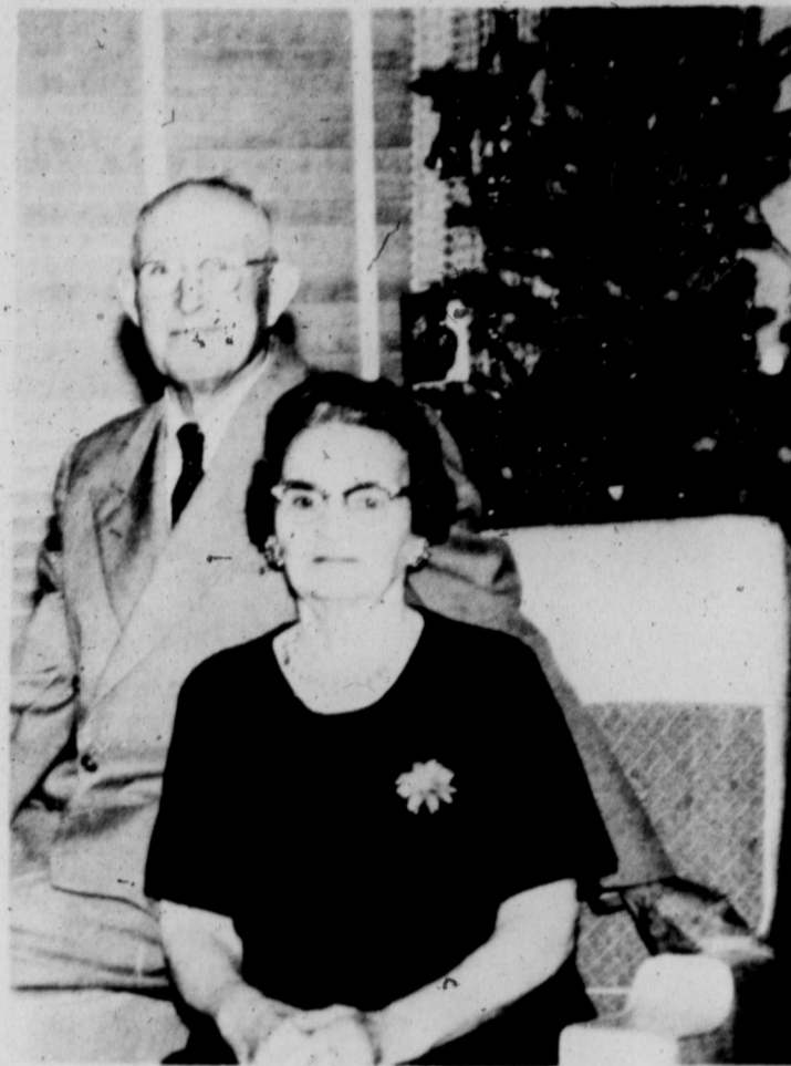
Christmas Eve Anniversary

Decorations for the party were arranged by Root Memorial Hospital Auxiliary.