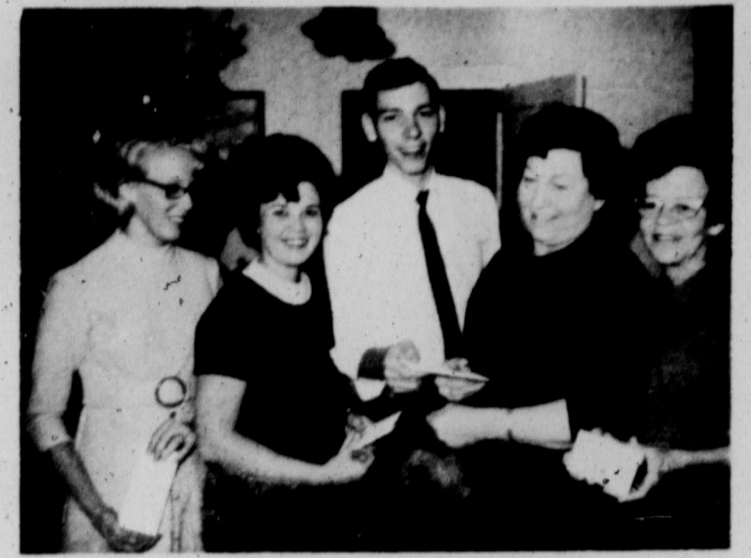
Bonuses for Christmas