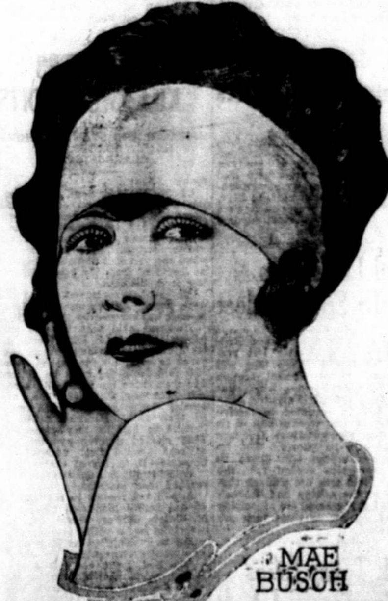
By Mae Busch

If you are one of the vast army of women who simply cannot attain the slender boyish lines your heart craves no matter how you try, and which Fashion so heartlessly demands of her adherents today, the next best thing you can do is to LOOK slender. There are many ways of looking much slimmer than you actually are. Choosing the proper lines and colors in clothes is one way of concealing rounded lines.