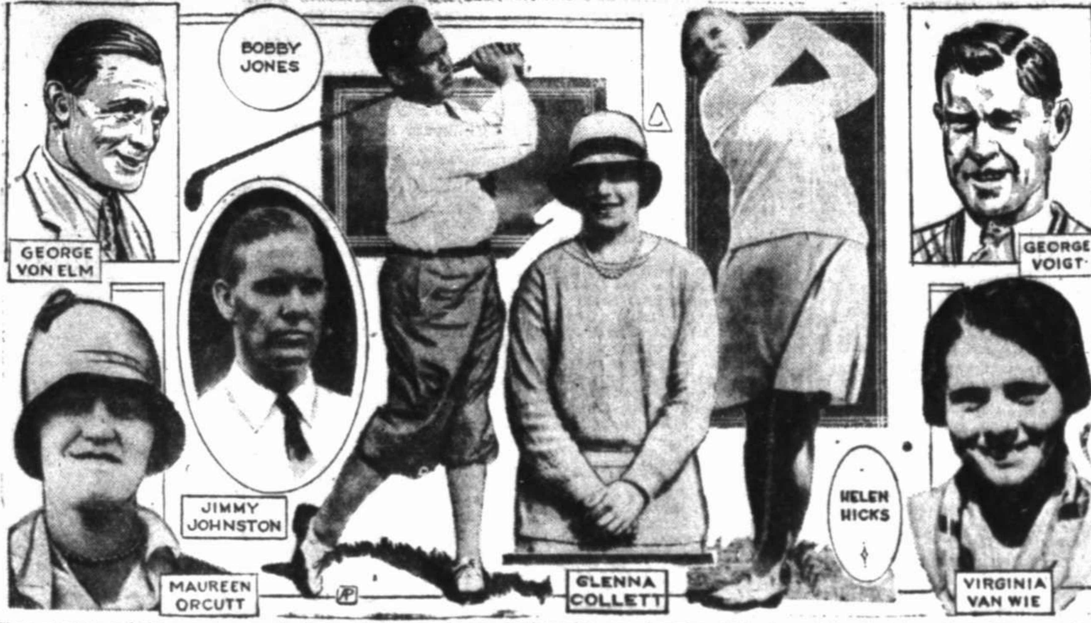
These amateur golf stars will carry the hopes of America in the forthcoming mass invasion of European links. Most important of the matches will come in the Walker cup play and the British amateur for the men and a special match and the British title tournament for the women.