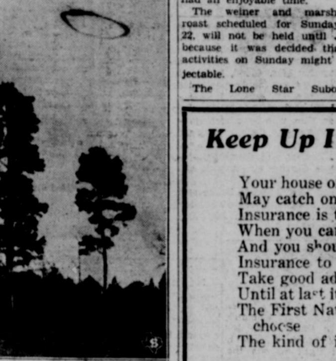
This smoke ring is three miles from the camera, which will give some idea of its size. The ring was caused by the explosion of an East Texas oil well between Overton and Henderson, Texas.