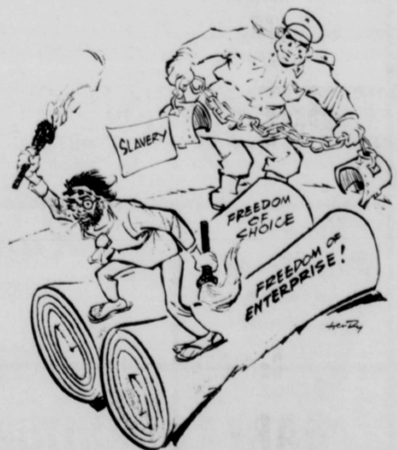
BURN, BABY BURN, - THEN WHAT?