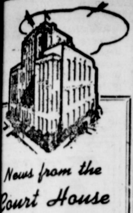
News from the Court House