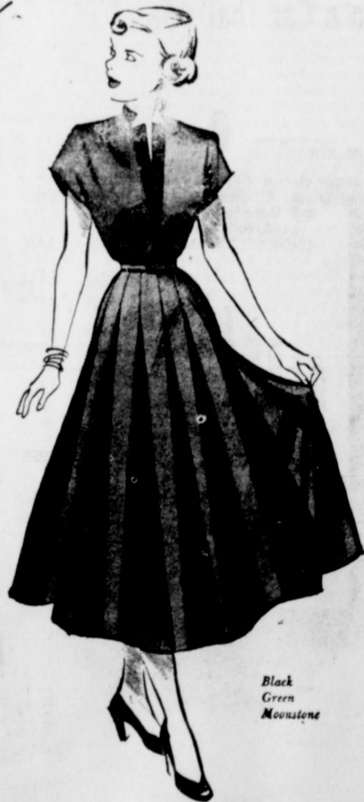
Black Green Moustache