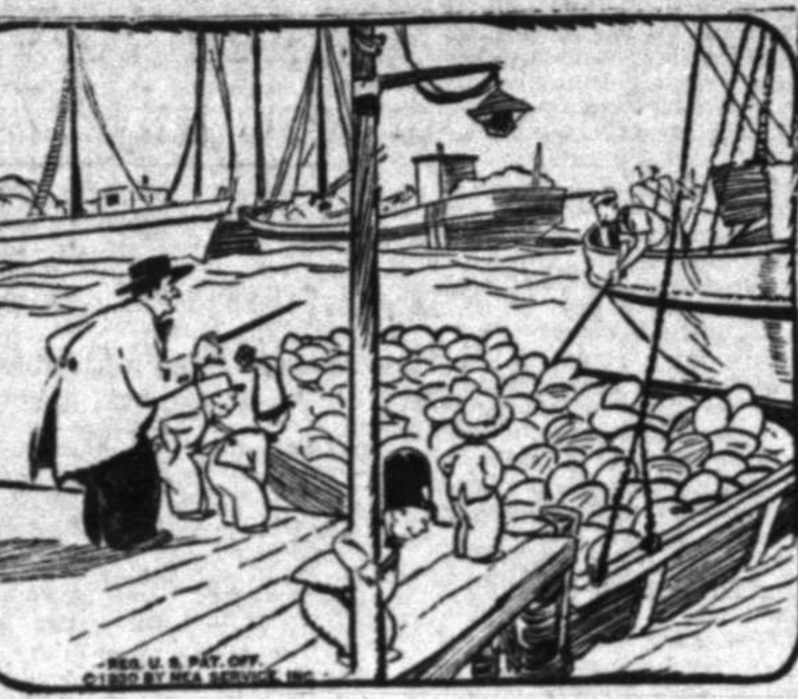
(READ THE STORY, THEN COLOR THE PICTURE)