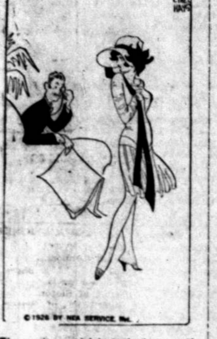
The easier a girl is to look upon the uglier she is.