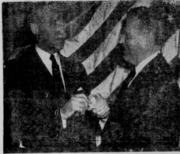
YARBOROUGH AWARDED MEDAL —Senator John Sherman Cooper of Kentucky, chairman of the Lincoln Sesquicentennial Commission, presents a "distinguished service" medal to Senator Ralph Yarborough for the Texas on the Lincoln Commission. Senator Yarborough, a Lincoln scholar for many years who has a personal collection of books and pamphlets on Lincoln's life and works, and was a contributor to the book of essays entitled: "Lincoln For The Ages." The Texas Senator is one of 76 well-known Americans whose remarks in the book deal with various phases of Lincoln's life.