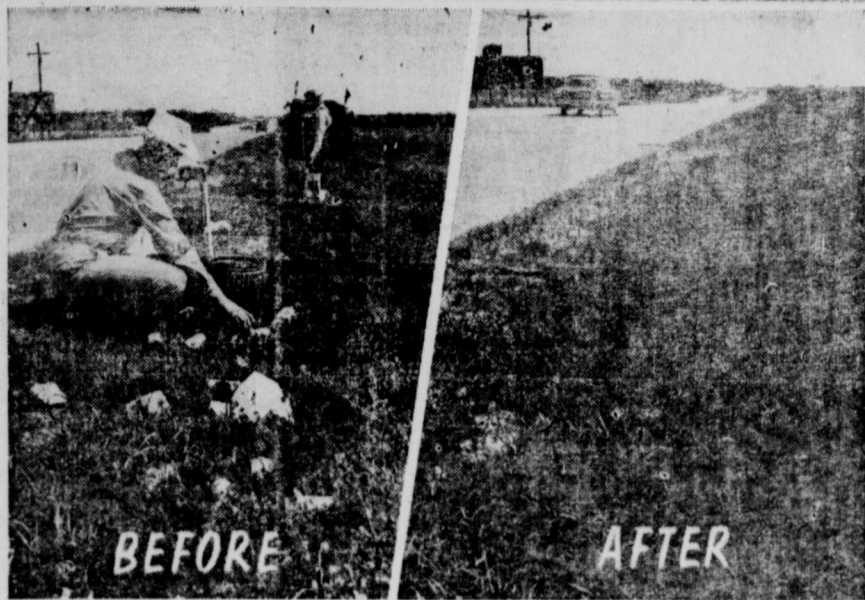
Litter tossed on Texas highways and roadsides has to be hand-picked. No machine can do this chore. Last year the clean-up and mowing bill for 57,500 maintained miles of Texas highways totaled more than $7,000,000.