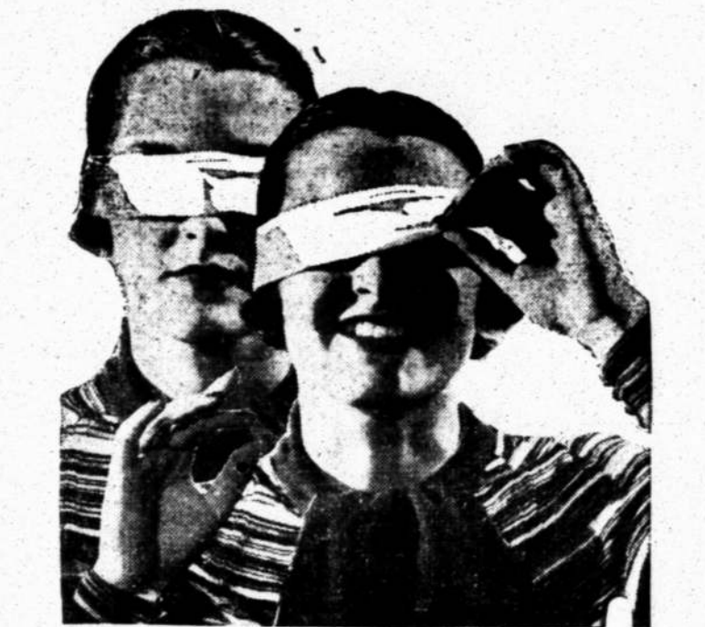
★ Now, that you see the light, be sure your family eats those nutritious foods so essential to better health.

U. S. Needs US Strong... Eat Nutritional Food WEST TEXAS GAS COMPANY