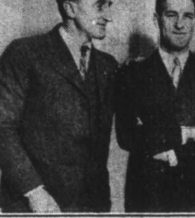
When the American League magnates met at Chicago recently, these three young managers spent a great deal of their time trying to arrange a few trades. Bucky Harris, of the Tigers, and Roger Peckinpaugh, of the Indians, did make one whereby George Uhle went to the Tigers for Jackie Tavener and Kenneth Holloway. Lena Blackburne, White Sox manager, couldn't horn in on that one, even though he wanted Uhle. Blackburne is shown at the left, Harris in the center, and Peck at the right.