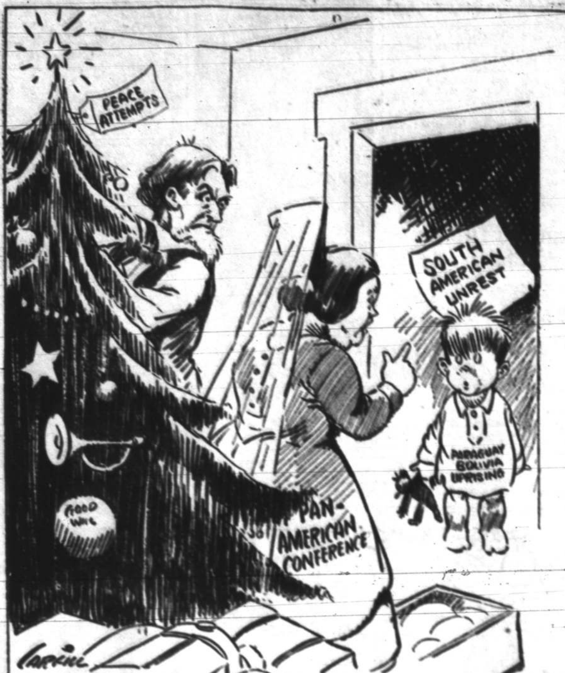
PARAGUAY BOLIVIA URUGUAY