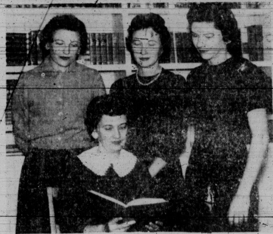
Plan For The Future