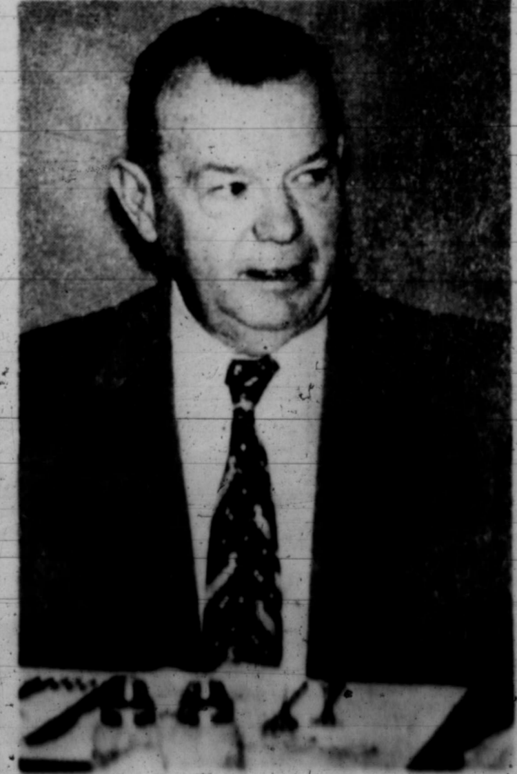
Hotel's New Owner