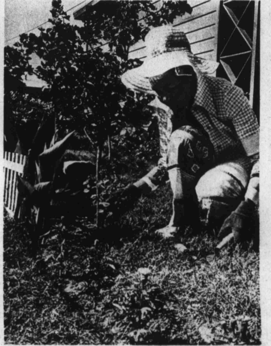
serious attitude by working in her garden at 1122 E. Cuthbert Ave.