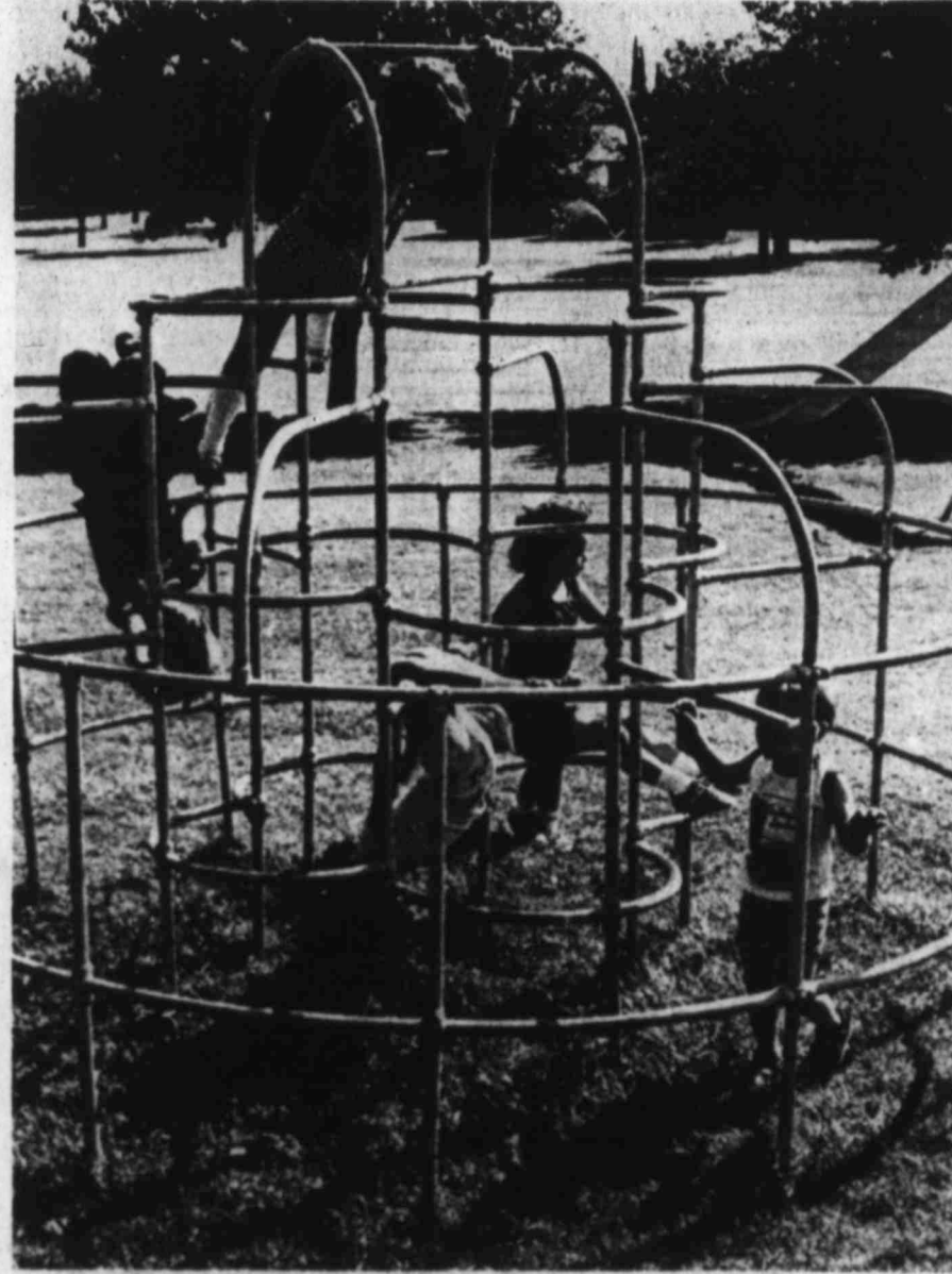
A SUMMER in the sun can mean many things, and Midlanders Wednesday managed to find a variety of ways to "celebrate" the first official

Meanwhile, two Soviets were accused of espionage in the United States, the Soviet Union in turn accused a former U.S. diplomat here of espionage and an American businessman in Moscow was arrested and charged with currency violations.