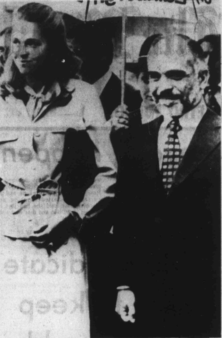
HONEYMOONING in Scotland are King Hussein and Queen Noor of Jordan. The couple, married last Thursday, arrived in Edinburgh Wednesday. Queen Noor is the former Lisa Halaby, an American-born architect.