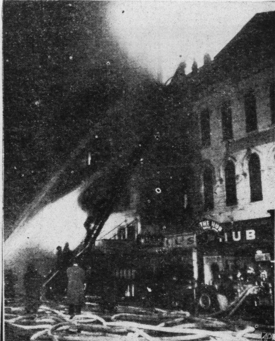
Firemen are shown here pumping 3,000,000 gallons of water on a fire in a furniture store on a main street in Houston, Texas. The damage was estimated at a million dollars.