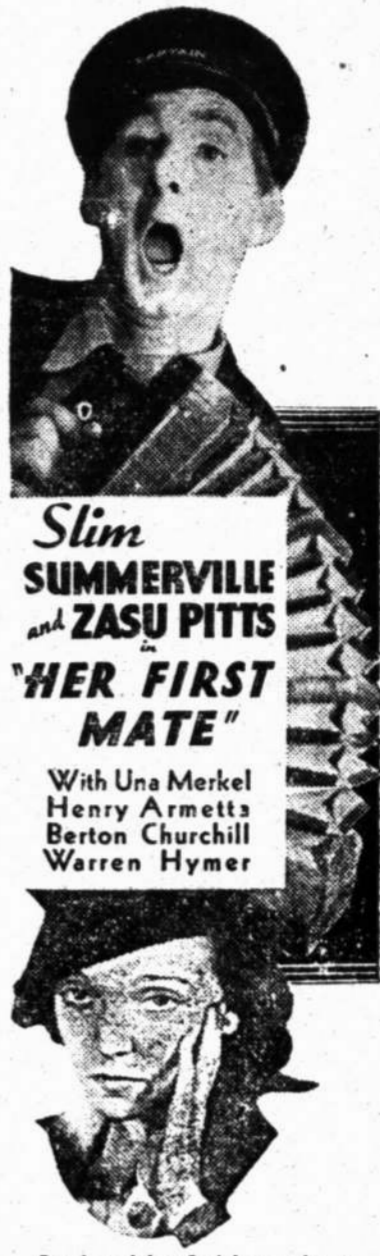
Produced by Carl Laemmle, Jr., from the play by Daniel Jarratt and John Golden. Presented by Carl Laemmle, A UNIVERSAL PICTURE.