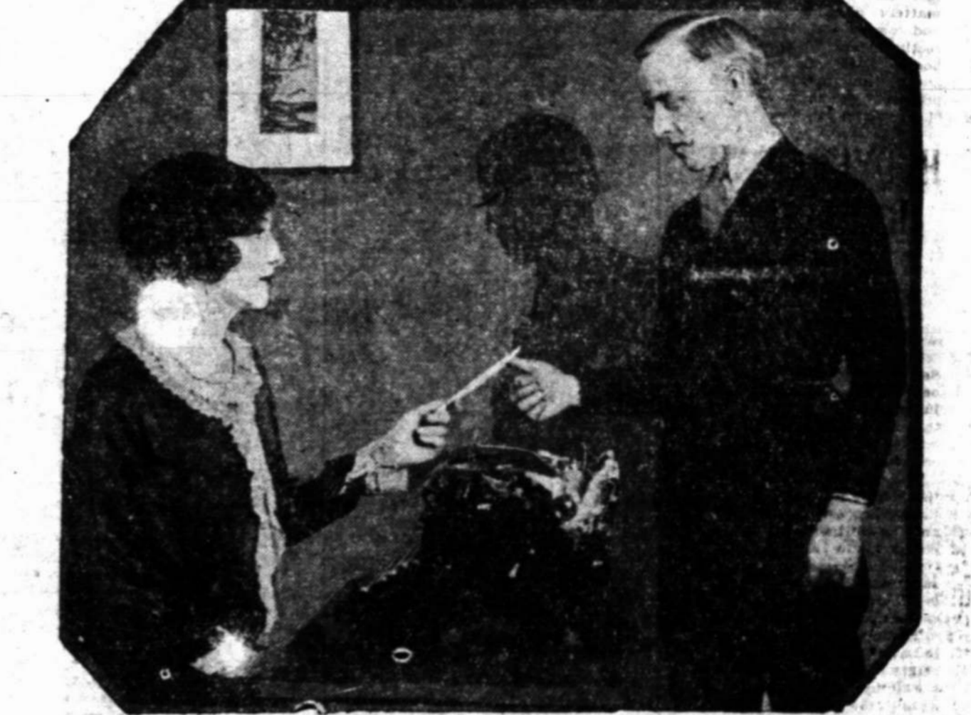
"Paul," she said to the office boy, "will you drop this in the mail box?"

New Go On With The Story CHAPTER XXXVII A long silence fell on them. The orchestra was playing that most passionate of love songs, "My Heart at Thy Sweet Voice," from "Samson and Delilah." Neither of them could utter a word; neither of them dared. It was Olga who broke the spell cast by the music. She shrugged her shoulders and raised her hands in airy gesture to utter a platitude. "Oh well, live and learn, Jim."