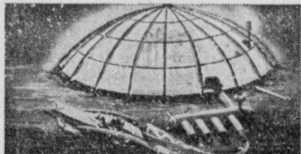
OCEANUS OUR WATER WORLD

Stirring musical reenactment of greatest moment in our history... The Declaration of Independence with Tom Jefferson, Ben Franklin, John Adams, etc.