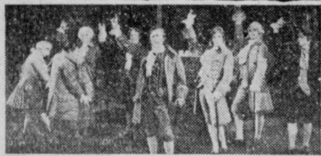
1770 BROADWAY MUSICAL HIT

Stirring musical reenactment of greatest moment in our history... The Declaration of Independence with Tom Jefferson, Ben Franklin, John Adams, etc.