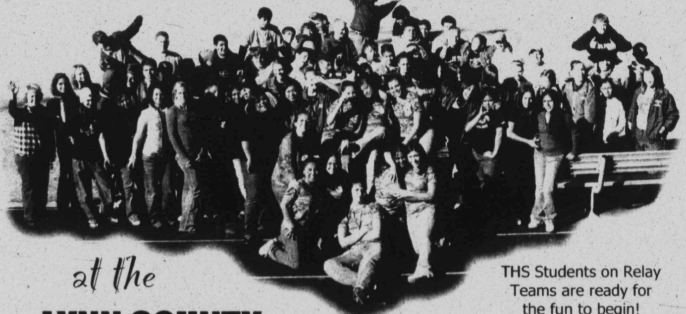
THS Students on Relay Teams are ready for the fun to begin!