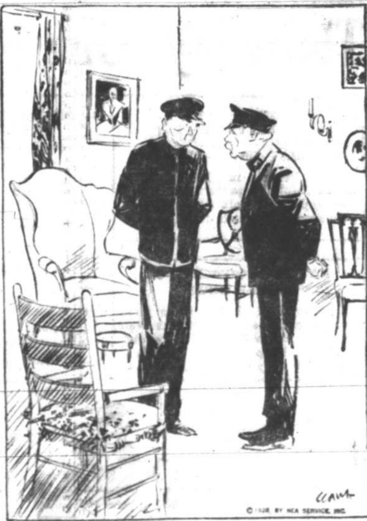
This museum job would be all right if a feller could sit down once in a while.