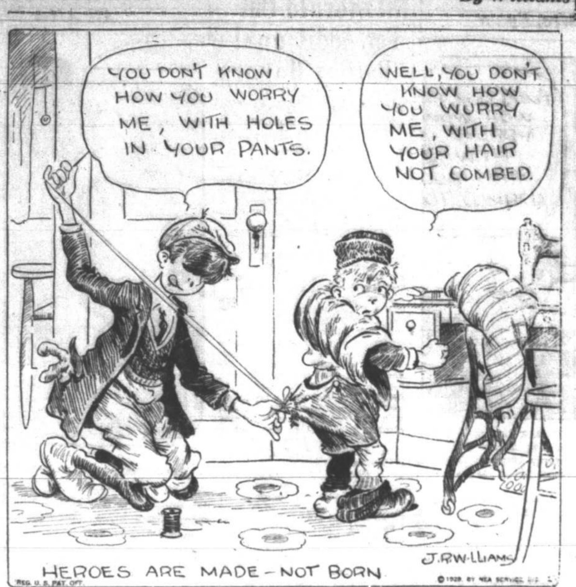
HEROES ARE MADE - NOT BORN

Heroes are made, not born. A favorite son with a large following. Dry forces in the state have asserted that the Republican nominees will receive their votes in the event Democrats select Smith.