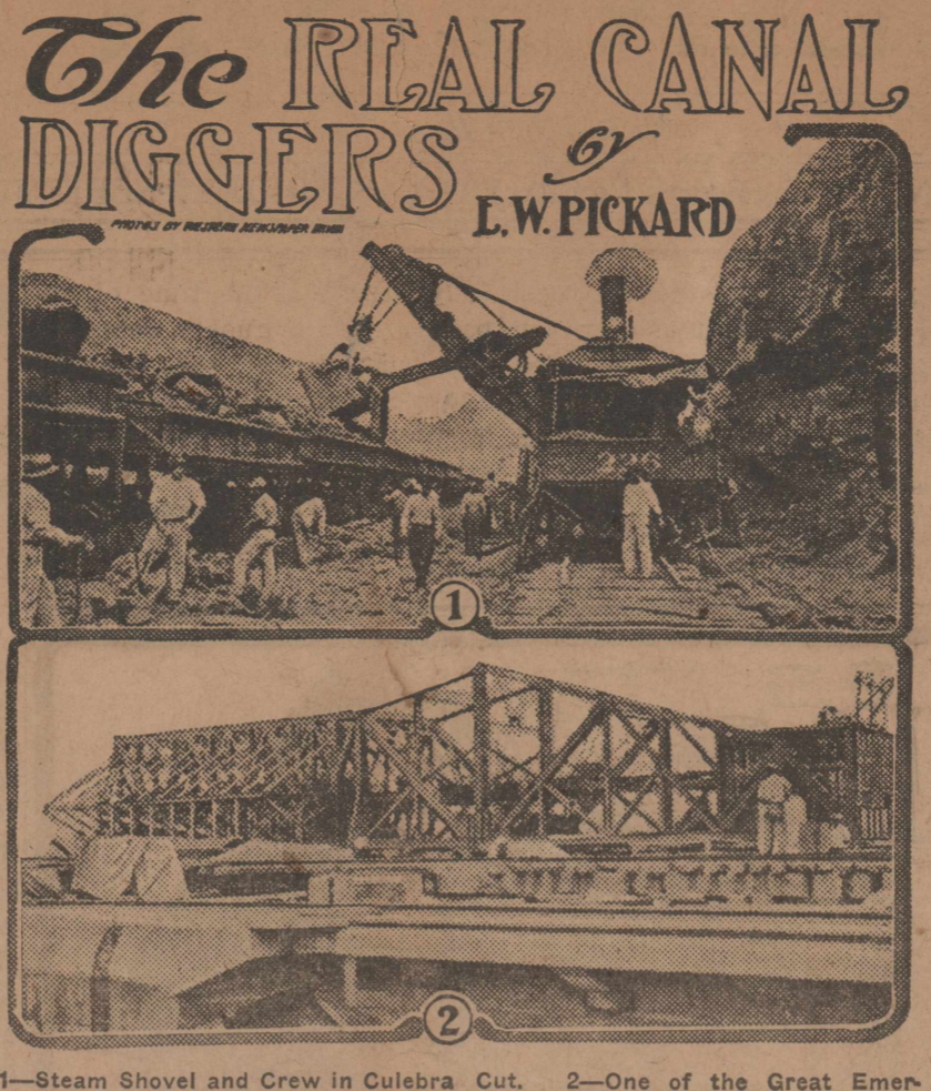
1—Steam Shovel and Crew in Culebra Cut. 2—One of the Great Emergency Dams Devised to Protect the Locks.