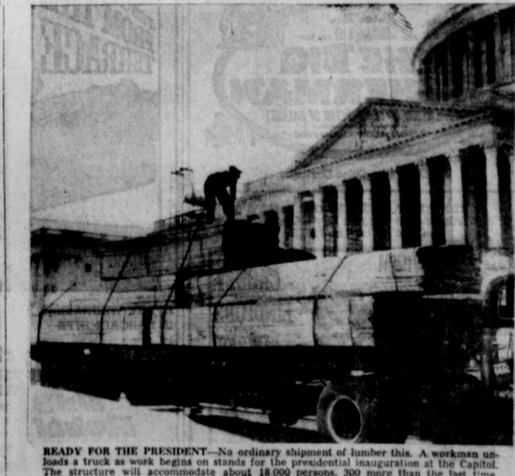
READY FOR THE PRESIDENT—No ordinary shipment of lumber this. A workman unloads a truck as work begins on stands for the presidential inauguration at the Capitol. The structure will accommodate about 18,000 persons, 300 more than the last time.

Last week, Nov. 4 or 5, many people across the nation received their first social security benefit checks - checks made possible for the first time by the 1960 amendments to the social security law.