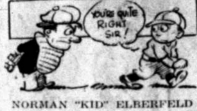
NORMAN "KID" ELBERFELD

Fans of other days recall Norman "Kid" Elberfeld, affectionately referred to as the "Tabasco Kid," as the greatest "umpire baiter" in the game.