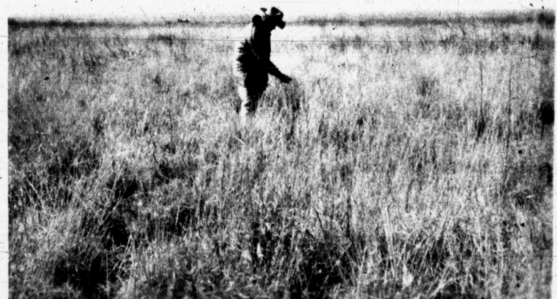
Brush Control & Range Seeding

The time and place for this fun-time event has been set for 8 p.m. Friday, April 11 in the Colorado High School gym.