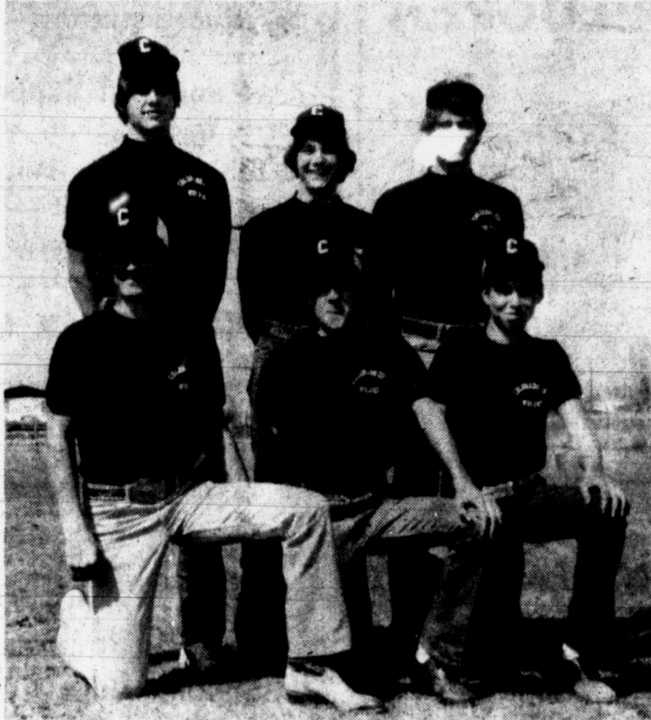
3rd Annual Record Invitational