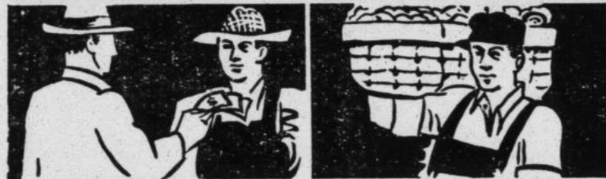
GUARANTEE FAIR PRICE