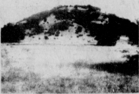
WEST CADDO PEAK