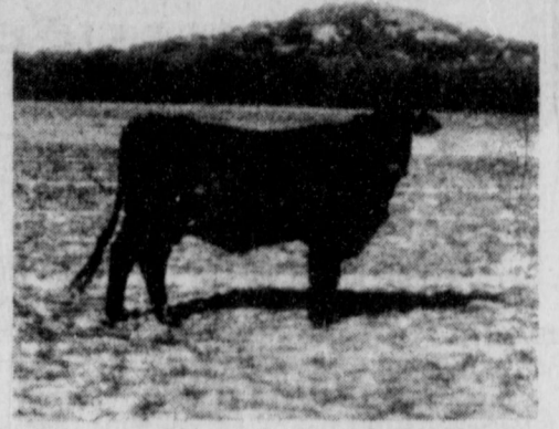
EAST CADDO PEAK Price 50¢