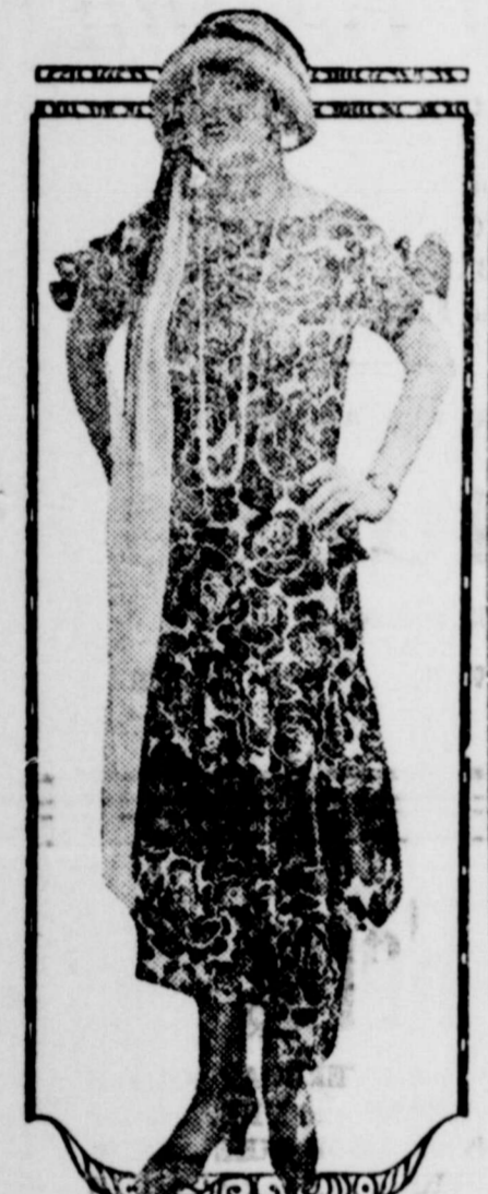
BILLIE DOVE SUPPORTING GEORGE O'BRIEN IN "THORNS OF PASSION" A WILLIAM FOX SPECIAL PRODUCTION