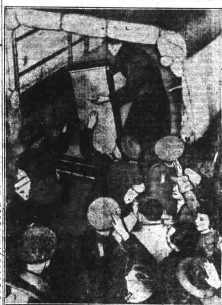
This Associated Press picture, rushed from Saarbruecken to London by plane and transmitted to New York by radio, shows a Saar ballot box being hoisted into a truck to be taken to Warburg house, where a counting of votes cast in the Saar plebiscite revealed an overwhelming decision to return the disputed area to Germany.