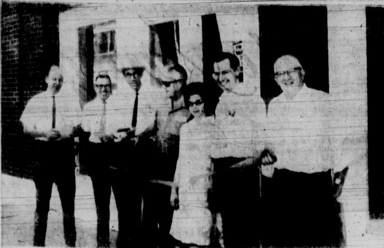
Western Auto Reopening Ceremonies

City, county and Chamber of Commerce officials were on hand for a ribbon cutting ceremony which opened the newly remodeled and enlarged Western Auto at First and Walnut Streets. They are,