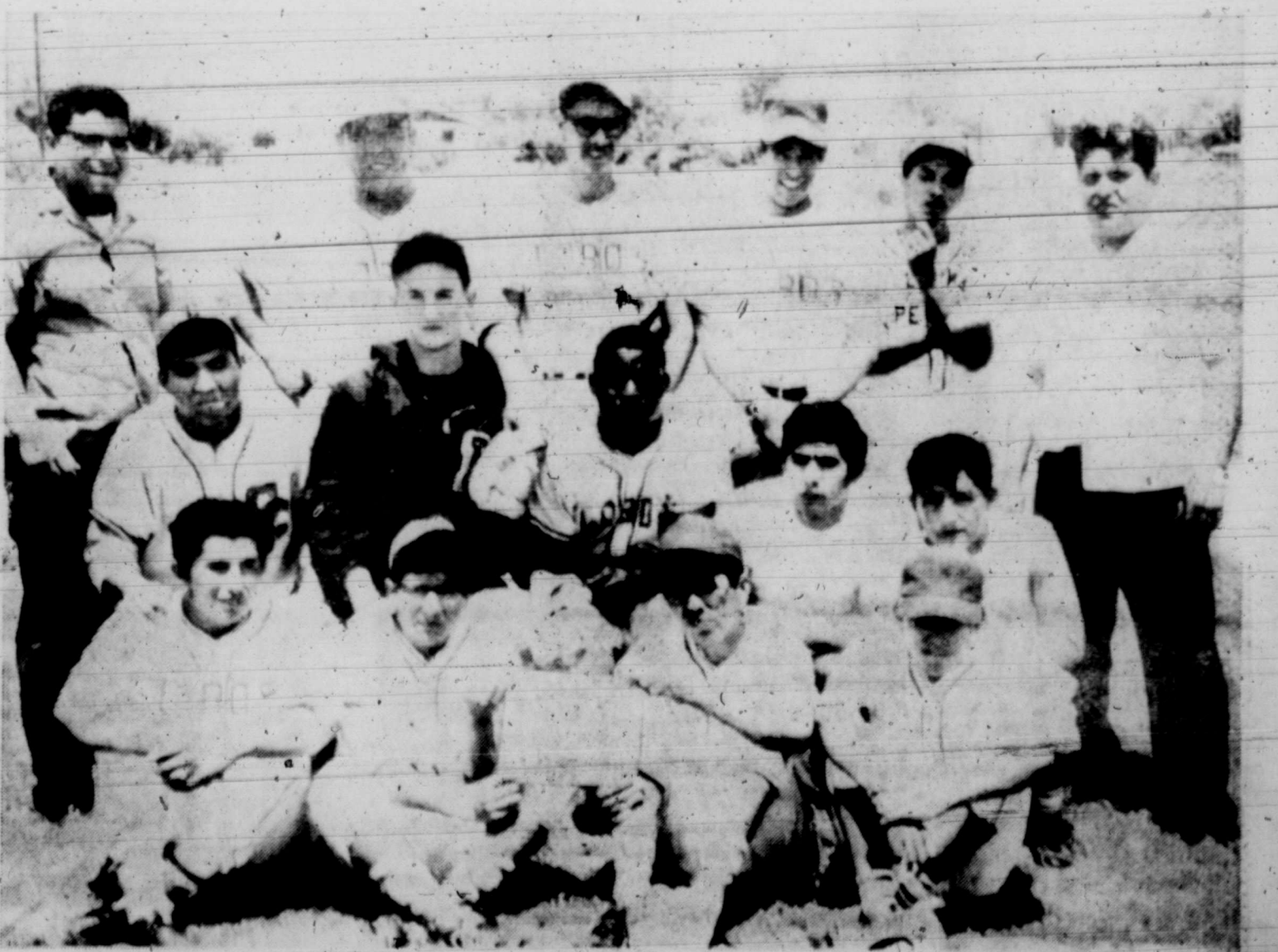
Now It's Official