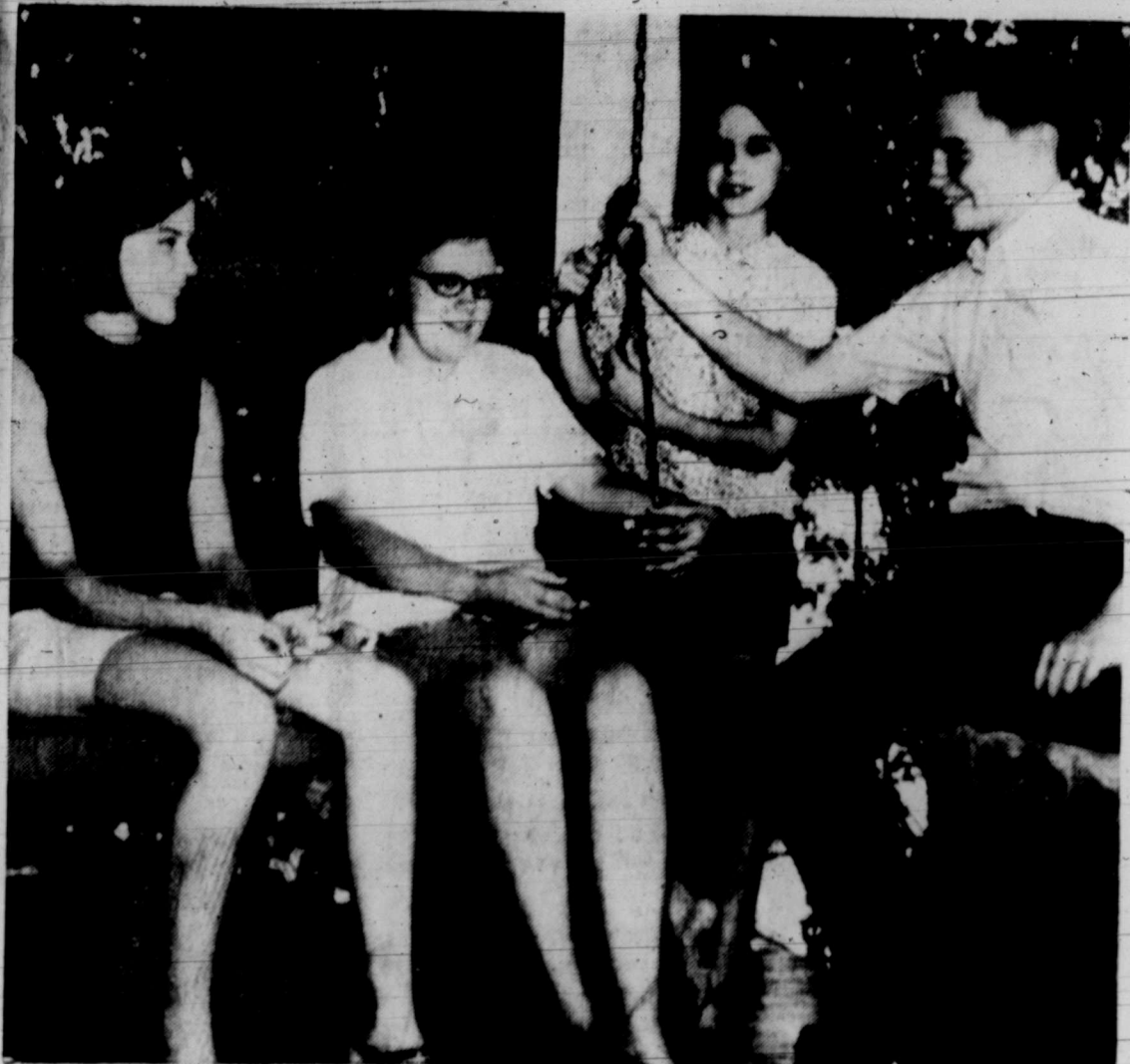
Summer Is For Cousins And a Swing Porch