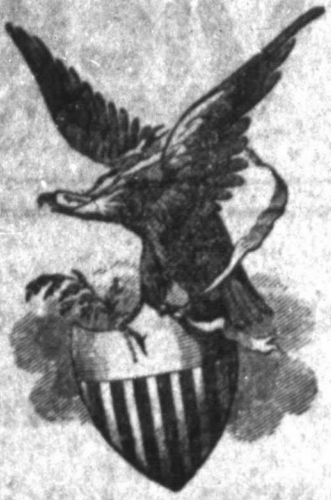
DEMOCRATIC IN POLITICS

Foreign Advertising Representative THE AMERICAN PRESS ASSOCIATION