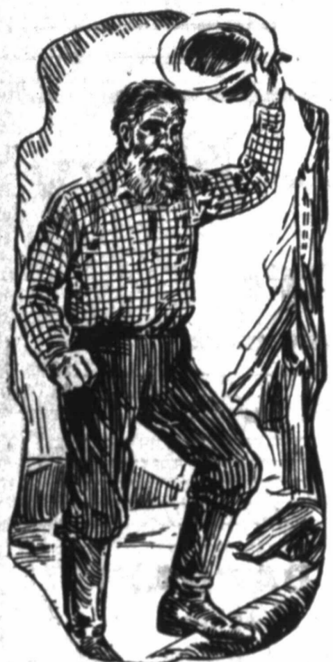
"Hooray!" He yelled. "Charley Bullerton's Dressed Your Mine for Ye!"

Beasley left me sitting on the doorstep—I've a notion he had run out of handcuffs, else he might have clapped a pair of them on me—while he started his posse down to Atropia with the captured raiders and their leader.