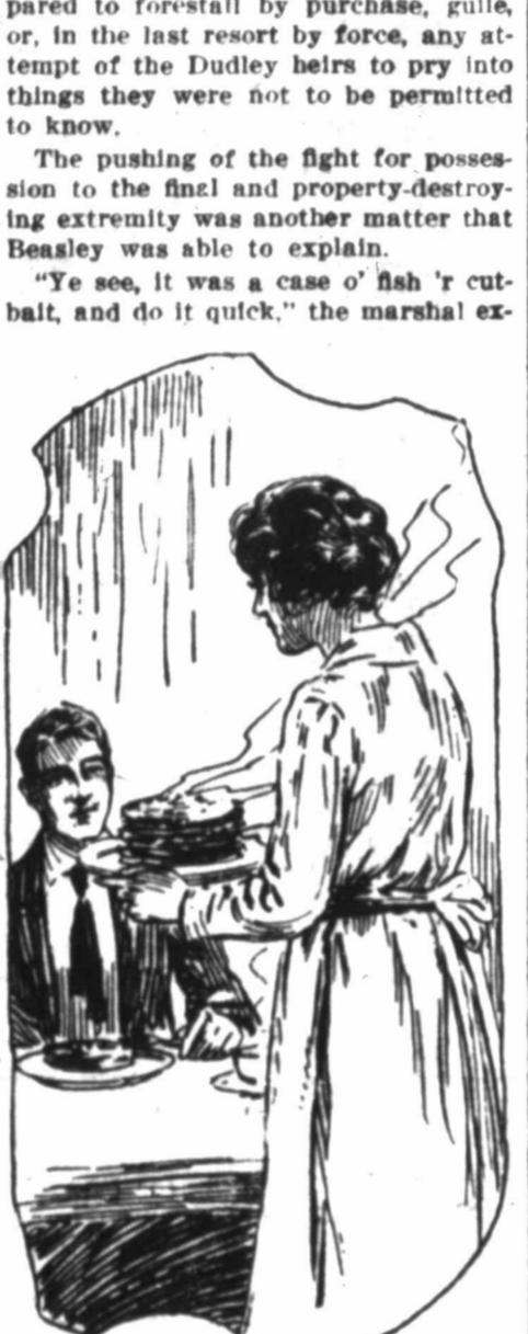
I Was Looking at Jeanie When I Replied.

He had not been so in the world from whom help could come. I should have said, looked me squarely in the eyes. "Stannie Broughton—if that's your name—you ain't so dad-blamed crazy as you look and act," he remarked.