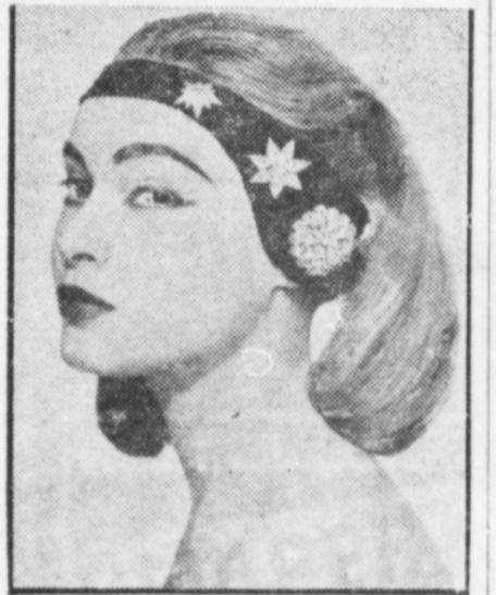
IT'S "BIBLICAL" — Current movies with Biblical backgrounds inspired this unusual coiffure by Guillame, Parisian hairdresser. It features a jewel-studded black velvet band that covers the ears and top of the forehead, leaving the hair to trail down in two loose chignons.