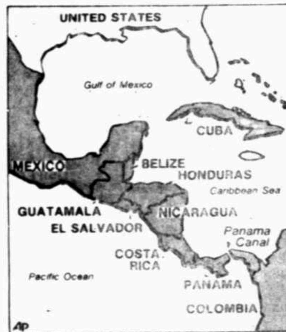
Related story, Page 1BB

However, Republicans said they felt the president's speech had helped him build support in Con-