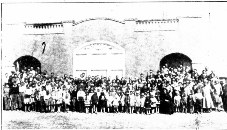
EDUCATIONAL BUILDING AND SUNDAY SCHOOL GROUP AT CAPS