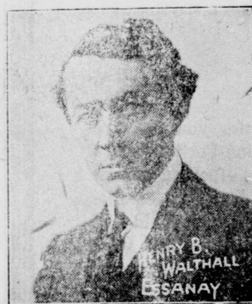
HENRY B. WALTHALL