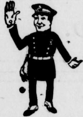
Traffic Officers will handle the crowd in and out of the theatre.

I hope nobody will miss the shows. They ain't much to do