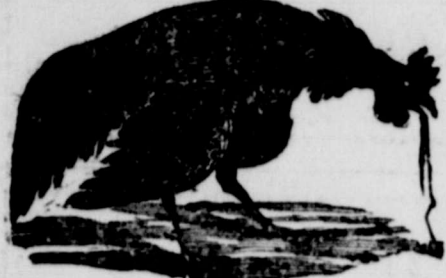
Gosh! I wish I'd went to see that Show!

around most everywhere from Elm Creek to the Colorado, and from Jim Ned to the Concho and he hadn't ever seen nothing that compared with the minstrels the Legion put on. That's going some aint it?