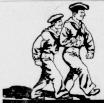
It's a Long Walk Buddy, but the Show will be worth it.

We couldn't help others and support ourselves.