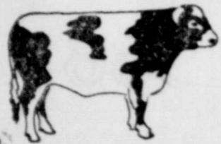
Editor-in-chief of This Section.

Now you have had one hour and fifteen minutes of good fun and the Minstrel is just ready to start. You have had what we know you will agree is your money's worth and the big show is only commencing. When the