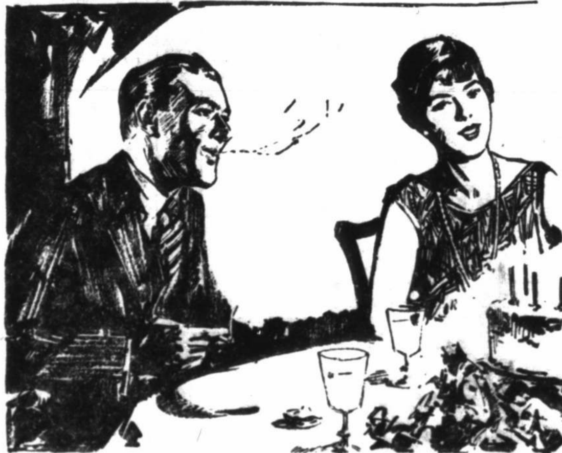
Camels contain the very choicest tobaccos grown in all the world. Camels are blended by the world's most expert blenders. Nothing is too good for Camels. In the making of this one brand we concentrate the tobacco knowledge and skill of the largest organization of tobacco experts in the world. No other cigarette made is like Camels. They are the overwhelming choice of experienced smokers.

When it's your birthday—and celebrating friends flock in for the glad event—when happy thoughts and laughter fill all the house—have a Camel!