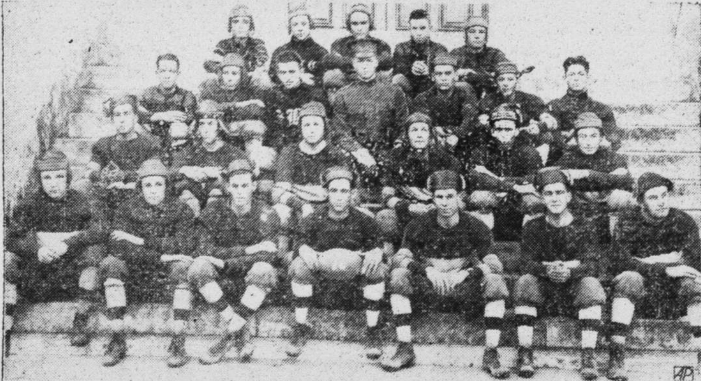
Maj. Gen. Dwight D. Eisenhower, a native Texan recently placed in charge of the European theater for American forces, once coached football at San Antonio. He is shown here (center next to top row in uniform) when he coached at St. Louis College (now St. Mary's University) in 1916. A member of the faculty recalled that Gen. Eisenhower, fresh out of West Point, managed to guide his boys to only one victory against three defeats, but was very popular with the students and was a true "morale builder."