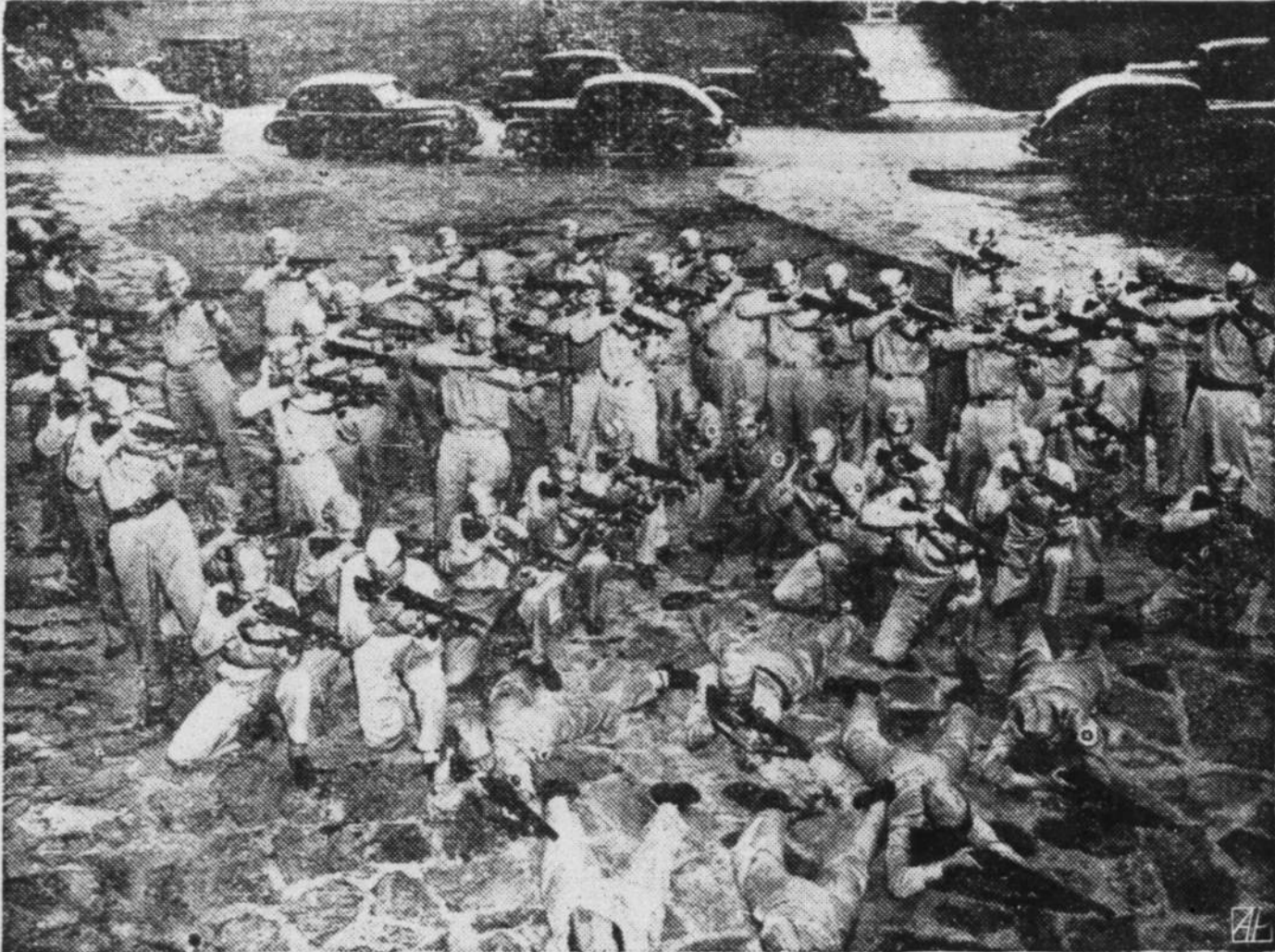
This group of Texas Defense Guardsmen, recently issued sub-machine guns, present a formidable barrier to would-be saboteurs or disturbers of civilian peace. The men, members of a Dallas company, are shown in one of their first drills with their new firearms.