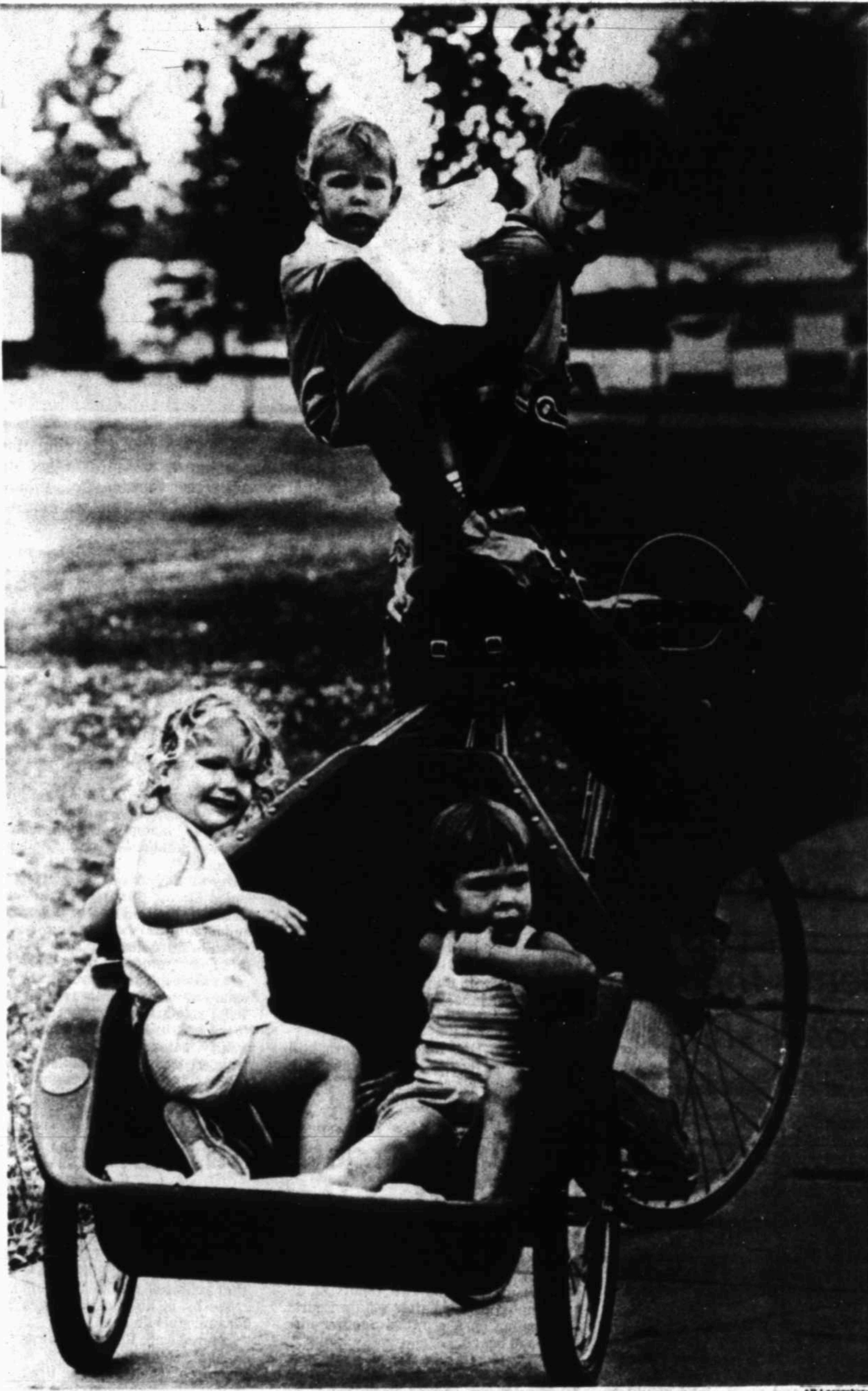
A family affair

DOE officials said the draft study is still being revised and Edwards has made no decision on what recommendation he will make to Reagan.